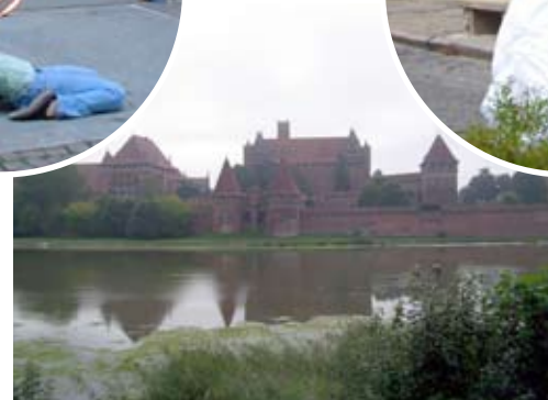
Marlbork Castle - Home of the Teutonic Knights