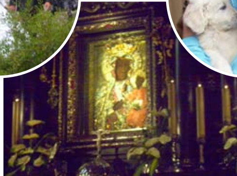
Original Painting of Our Lady of Czestochowa