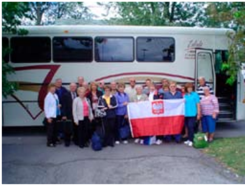
Our Tour Group