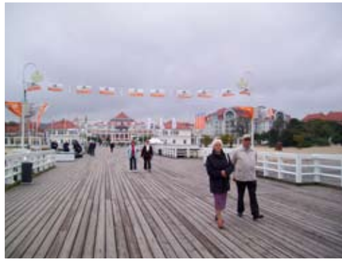
Boardwalk Pier on the Baltic Coast