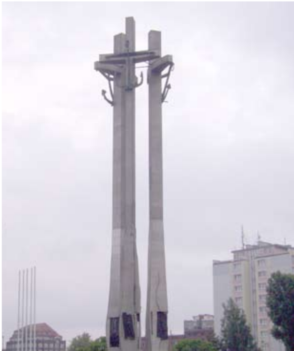
Triple Crosses at Shipyard in Gdansk