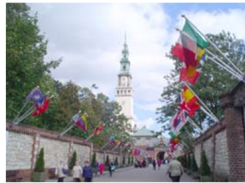
Entryway to the Shrine of Our Lady of Czestochowa