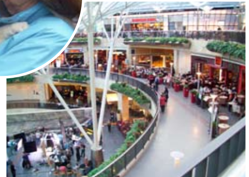
Shopping Mall in Warsaw, Poland