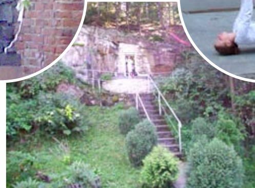
Shrine Built into Hillside