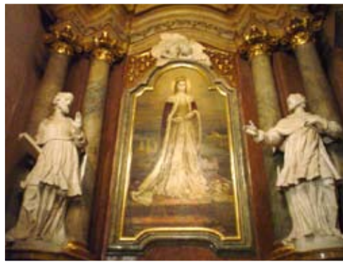
Saint Jadwiga (Saint Hedwig), King of Poland