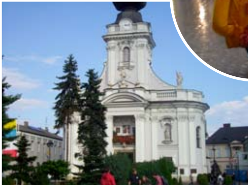
Polish Pope's Church & Apartment (r.) During Childhood