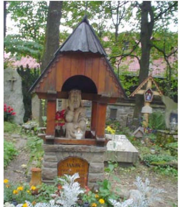
Old Cemetery in Zakopane